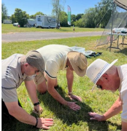
This picture shows the commitment to finding a lost sewing needle.

Look at the glorious sunshine (blue sky) and lovely short grass. The location of this rally is fantastic for walks, or a bus ride to the seafront. There is also a great pub near by that does really good food.