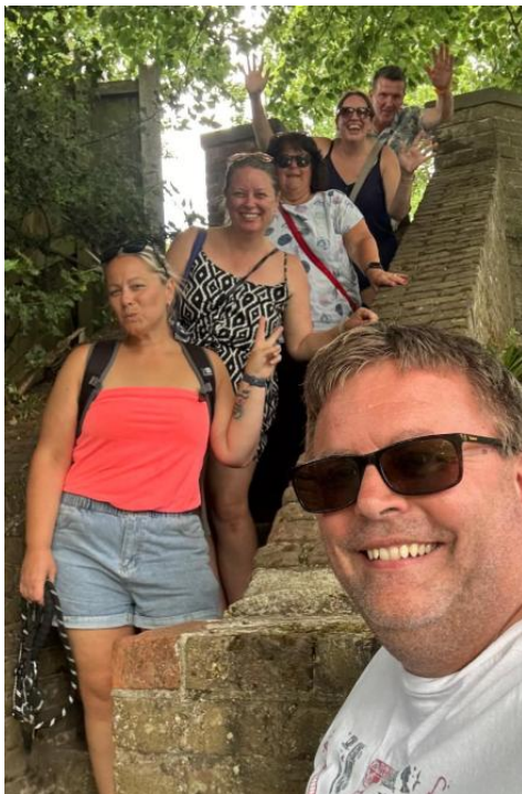
Pork Chop Panties