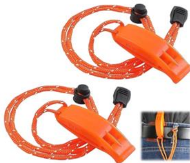
Emergency Survival Whistle

We are lucky enough to have experienced Emergency Services Staff in our team now, and recommendations are that we should adopt Whistles as our primary alarm/evacuation signal.