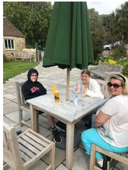
Bagwell Pub Refreshments!!