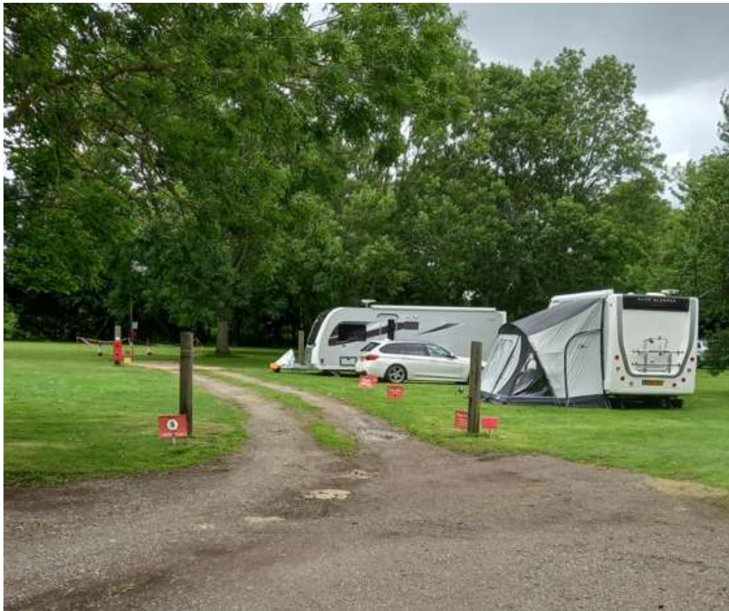
The Rally Officers await the Ralliers!!