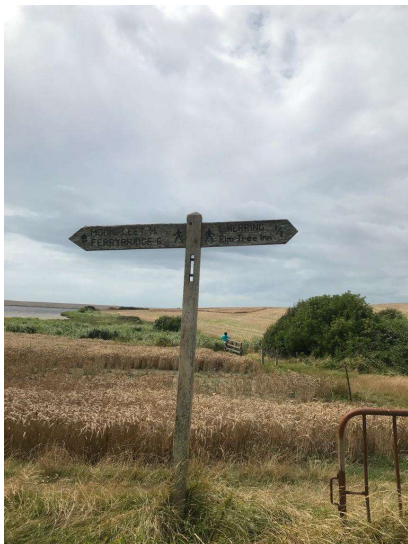
The route to the pub at Bagwell