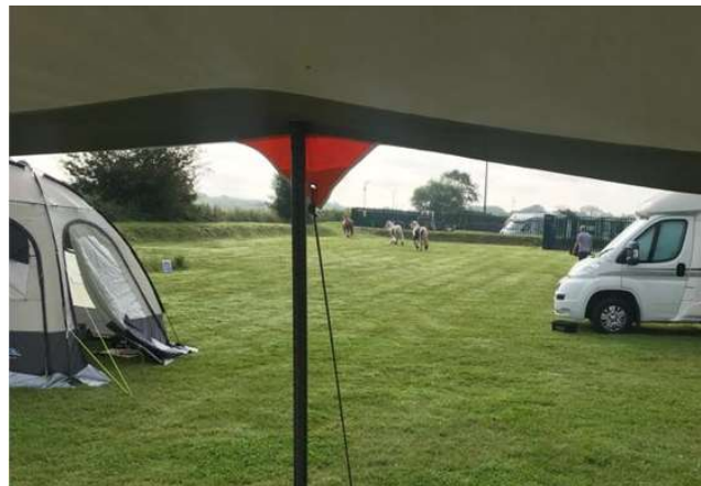
New ralliers (horses) at SunnyDale!!