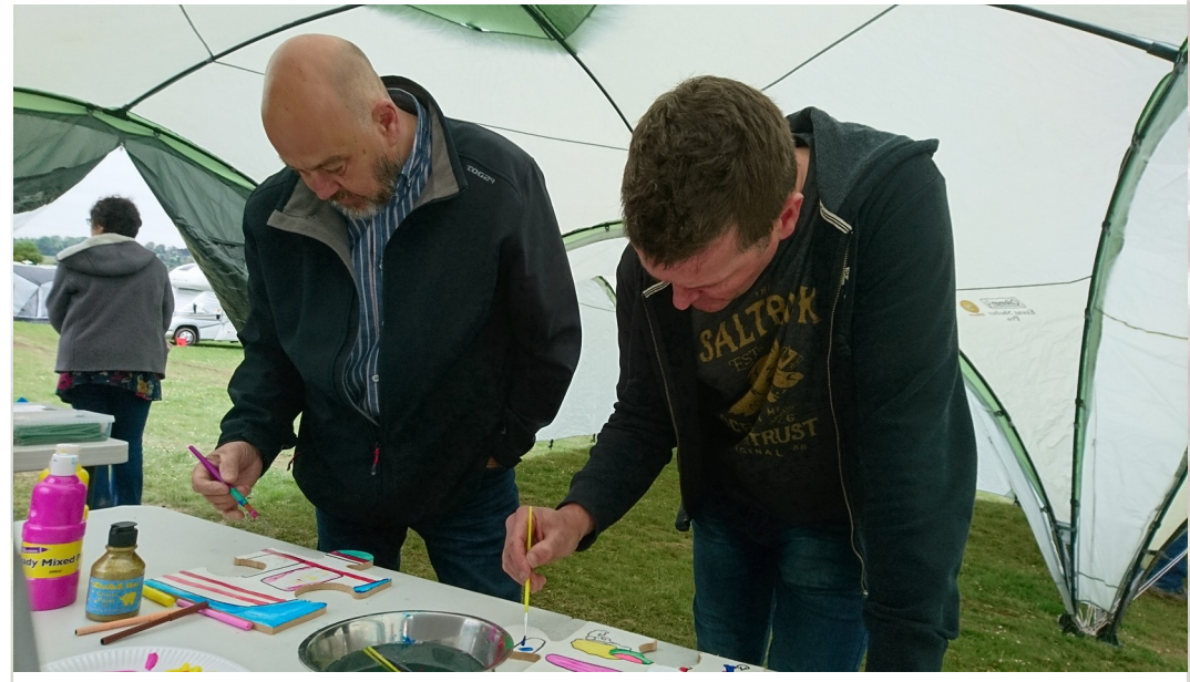
Even the big kids had a go!

As the first outfits arrived, so did the rain, and within less than a dozen arrivals the Rally Office approach was quagmire and closed. Instead Ralliers were