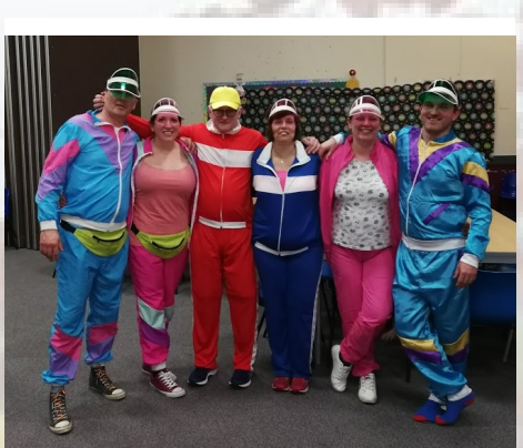
The Rally Officers put everything into making the Rally amazing!

gentle social of catching up with buddies we had not seen since the last rally. Nibbles and sweets were provided in an 80's style (the "bowl" was a VHS case!) and I must admit to polishing off probably more than my fair share – but they were so..... lovely! (Thank you Rally Officers :-D )