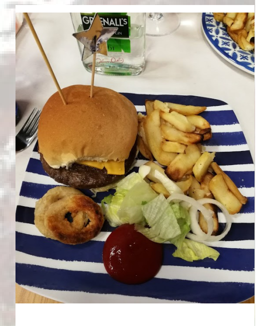
Our first nights food - Don't ever let it be said that I am a salad dodger!

11:00, that I did not attend but understand it was great fun. Then in the evening was the first of the hot