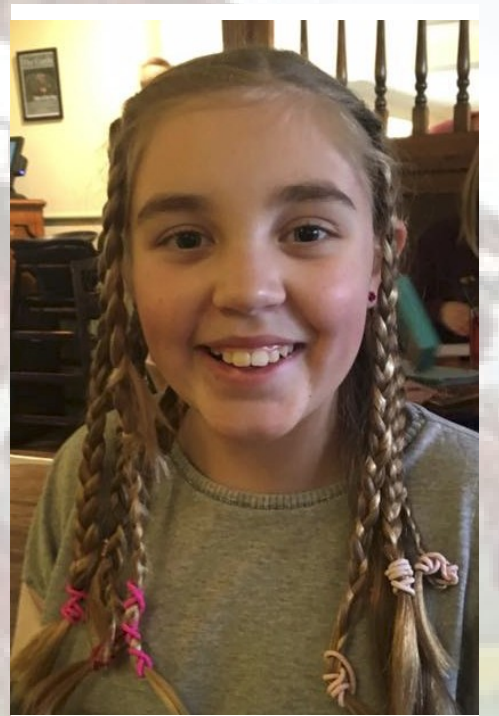
Hope you had a superb Birthday Issy!