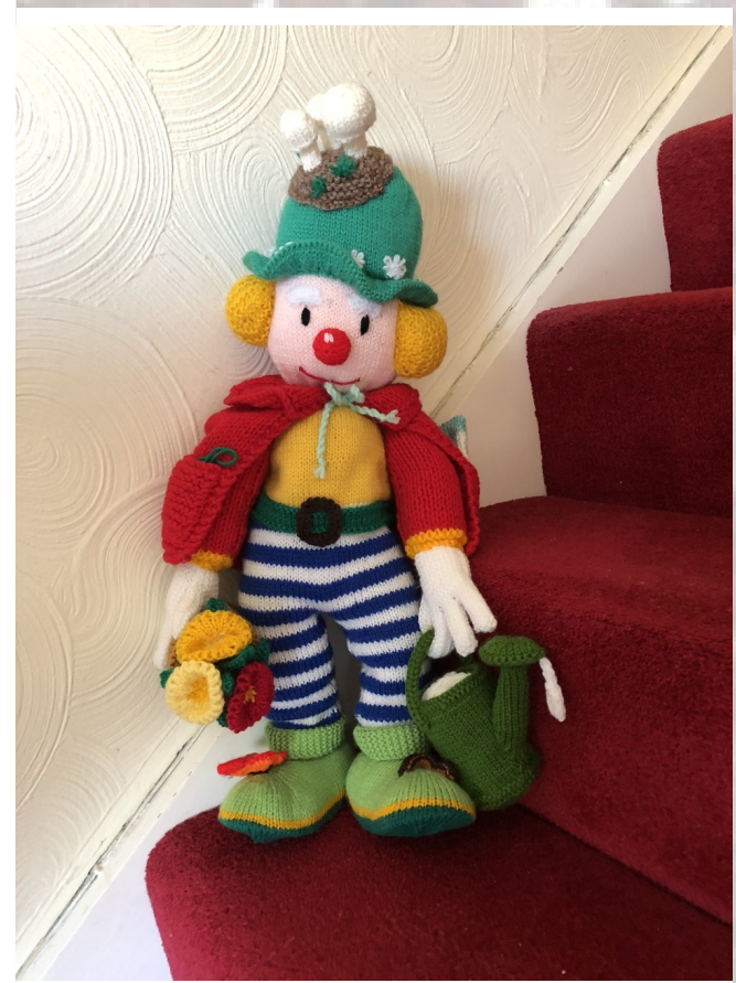
The amazing knitted clown donated by Pauline Cane