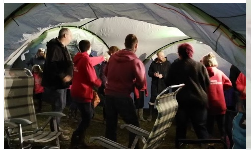
Frustration for the parents..

generation of ralliers with the reconstruction of the picture.